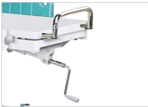
CRANK HANDLE Equipped excellent crank driven enable full adjusted product solution