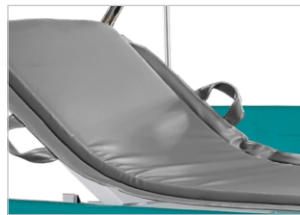
UPHOLSTERY Provided upholstery with positional wide surface excellent support and comfort for patient treatments.