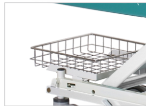
BASKET Equipped excellent stainless steel holder basket.