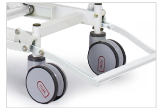
CASTORS Giving smooth product moving fitted 6" double wheels castor.